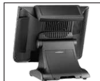
SP-820 with the 2x20 VFD (Optional)