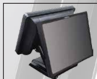
SP-820 with the 15" Bezel Free LCD (Optional)