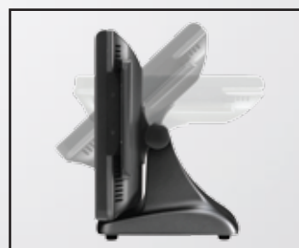
Wide Tilt Angle