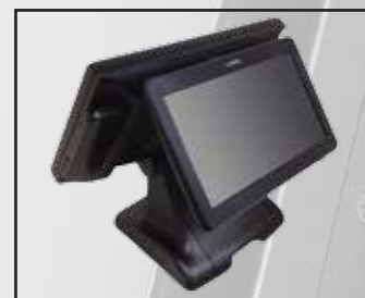
SP-820 with the 11.6" LCD (Optional)