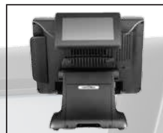
SP-820 with the 7" LCD (Optional)