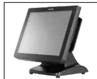
SP-820 Bezel Free (Optional)